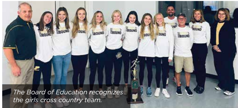
The Board of Education recognizes the girls cross country team.