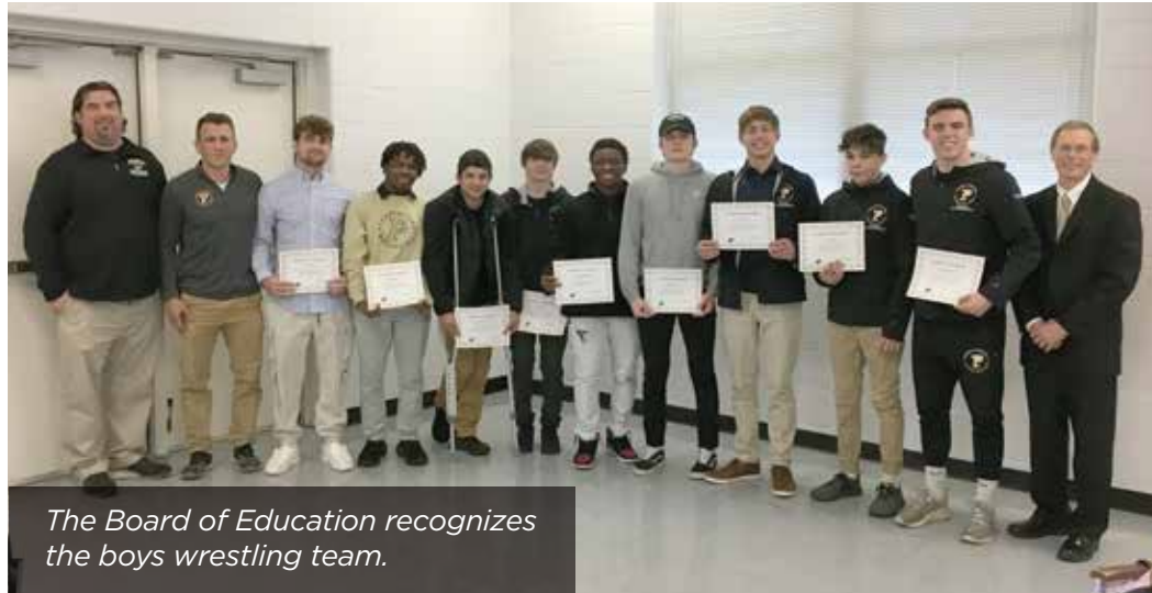
The Board of Education recognizes the boys wrestling team.